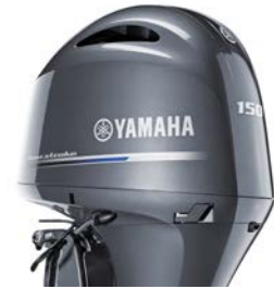
Remote control model (ET)

An attractive appearance is not the only advantage of this purposeful-looking cowling. It is designed to trap and drain water with maximum efficiency, leading to even smoother operation, less corrosion and longer engine life.