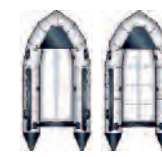
CLASSIC MARK 2 C 3,8 m / 12'6"