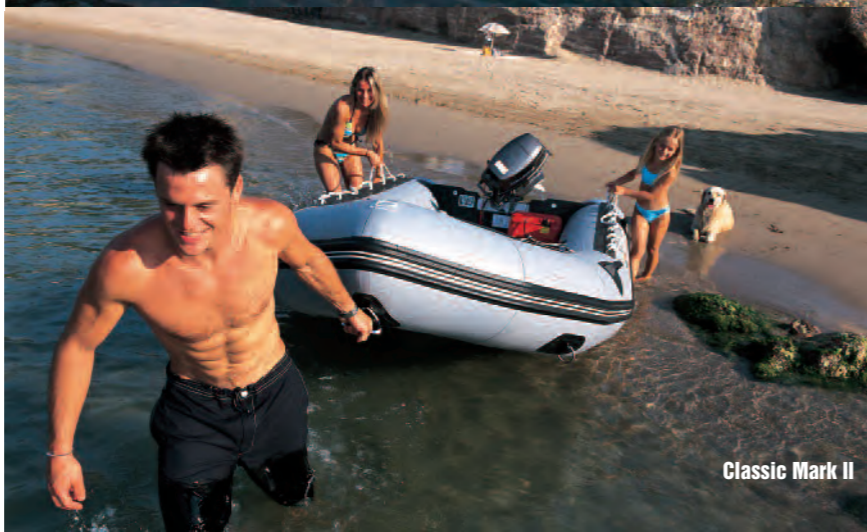
Classic Mark II