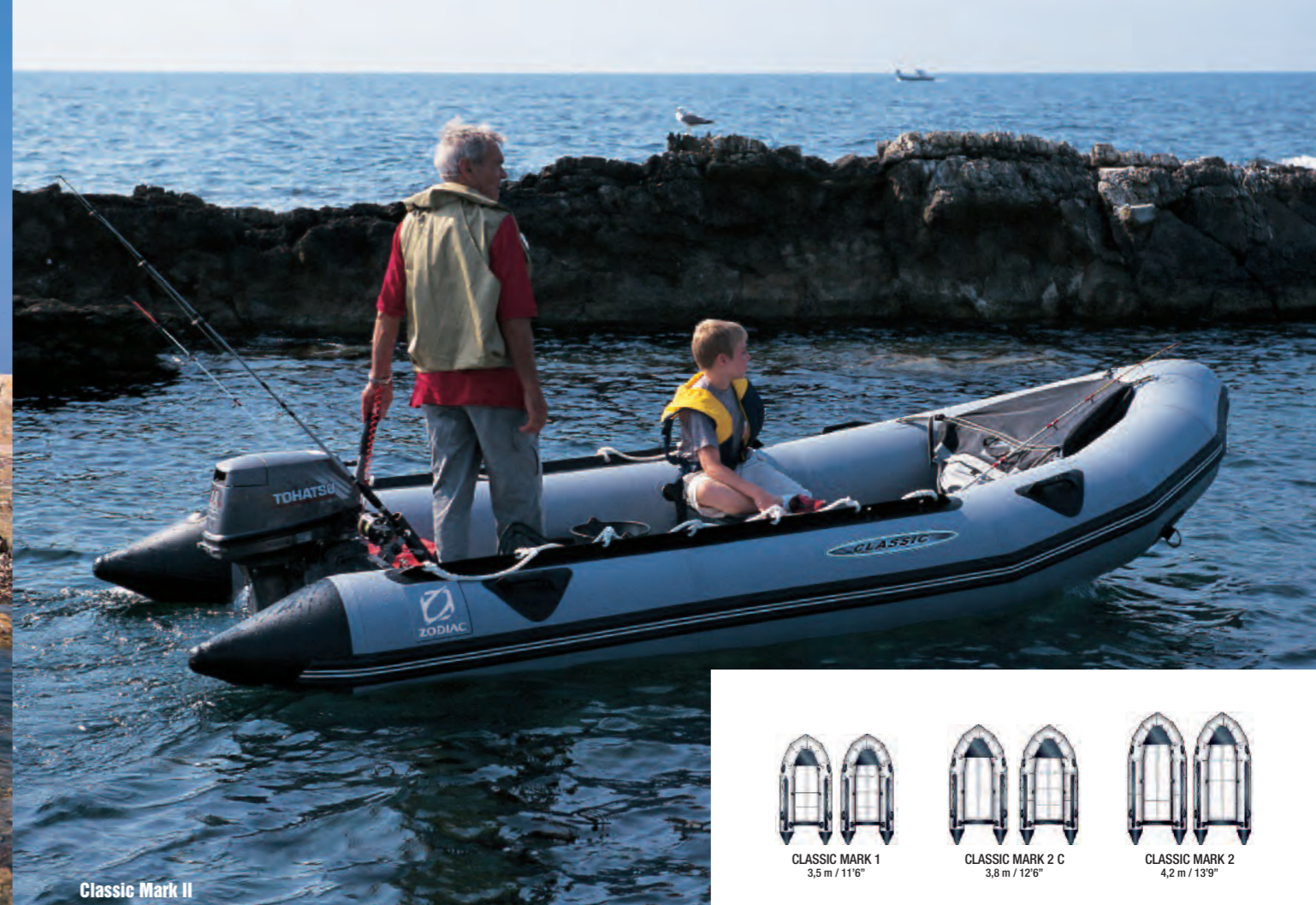
Classic Mark II