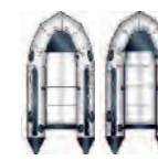
CLASSIC MARK 1 3,5 m / 11'6"